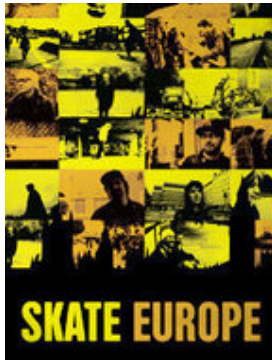
Skate Europe – 7 X 23'-34'

This show brings you into the world of pro surfers. A quiet guide to the rhythms of surfing life and their capers in and out of the water. Watch them make surfboards, talk about the sport, and hang out.