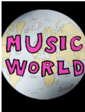
Music World – 38 X 3'-31'