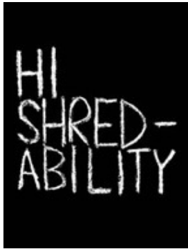
High Shredability – 18 X 3'-20'