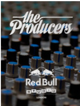
The Producers – 6 X 8'

A tour of cinema in the strangest parts of the world! Bringing us inside the most dysfunctional film communities around, it reveals everything you didn't know about film but will soon want to. We go to North Korea where Kim Jong Il's film obsession is exposed, find out why Iranian film is booming and try to figure out what Narco Cinema is.