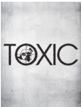
Toxic – 7 X 20'-67'