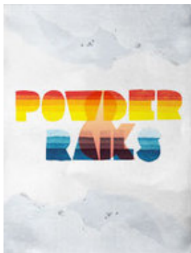
Powder and Rails – 34 X 6'-25'

We get an insight into skateboarding culture in Europe as we speak to the legends behind the sport across the continent. These sporting heroes bring us around their favourite skating spots, shedding light on the history of the sport in their city and pulling off some amazing tricks.