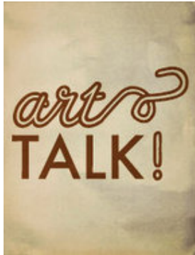
Art Talk – 36 X 4'-21'