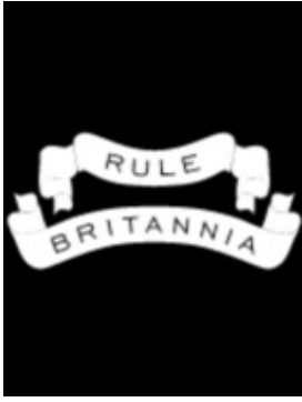
Rule Britannia – 8 episodes