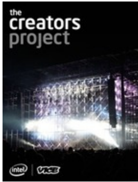
The Creators Project - 74 X 5'-10'