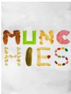
Munchies – 6 X 10'-12'