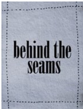
Behind The Seams – 10 X 4'-13'

Meet today's creative heads. Storming the brains and studios of many of the world's less celebrated creative geniuses. Through interviews we find out about their work, what makes them tick and how they became who they are today. Featuring the costume designer for Spike Jonze, the cinematographer for Buffalo 66 and painter Miguel Calderon. It's fine arts coverage at its most invasive.